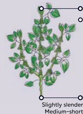
Slightly slender Medium-short

This hardy variety dominates agronomically and financially