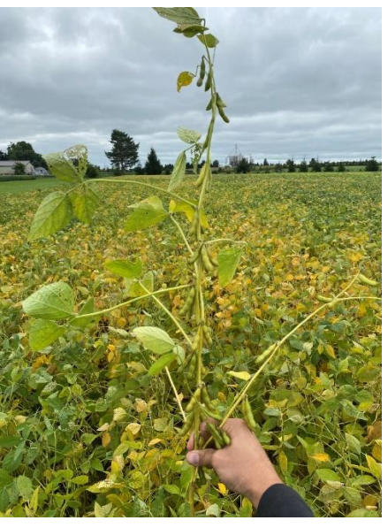
© Presentation and data collection by Prograin. All rights reserved. Semences Prograin inc. 145, Bas-de-la-Rivière Nord, St-Césaire (Québec) JOL 1TO Canada