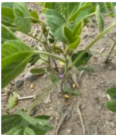
Hakata, June 20th